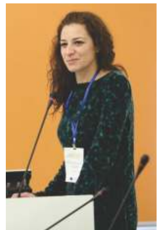
Sarajevo Meeting of Culture Presentation of the partners