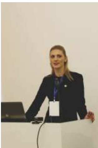
Unviersity of Travnik Presentation of the partners