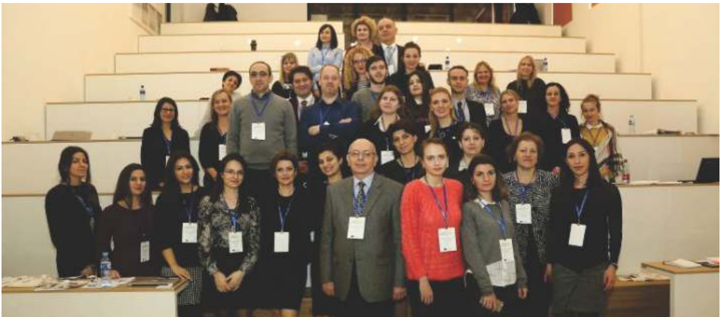
Closing ceremony (AUA)