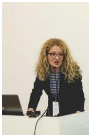
Unviersity of Tuzla Presentation of the partners