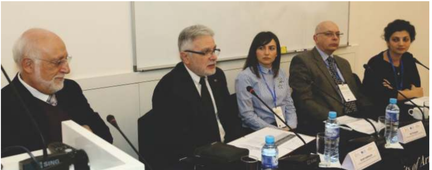
Opening ceremony (AUA)